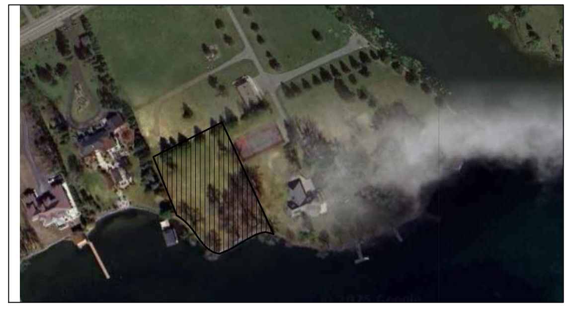
02 KEY PLAN A1.0 SCALE: N.T.S.